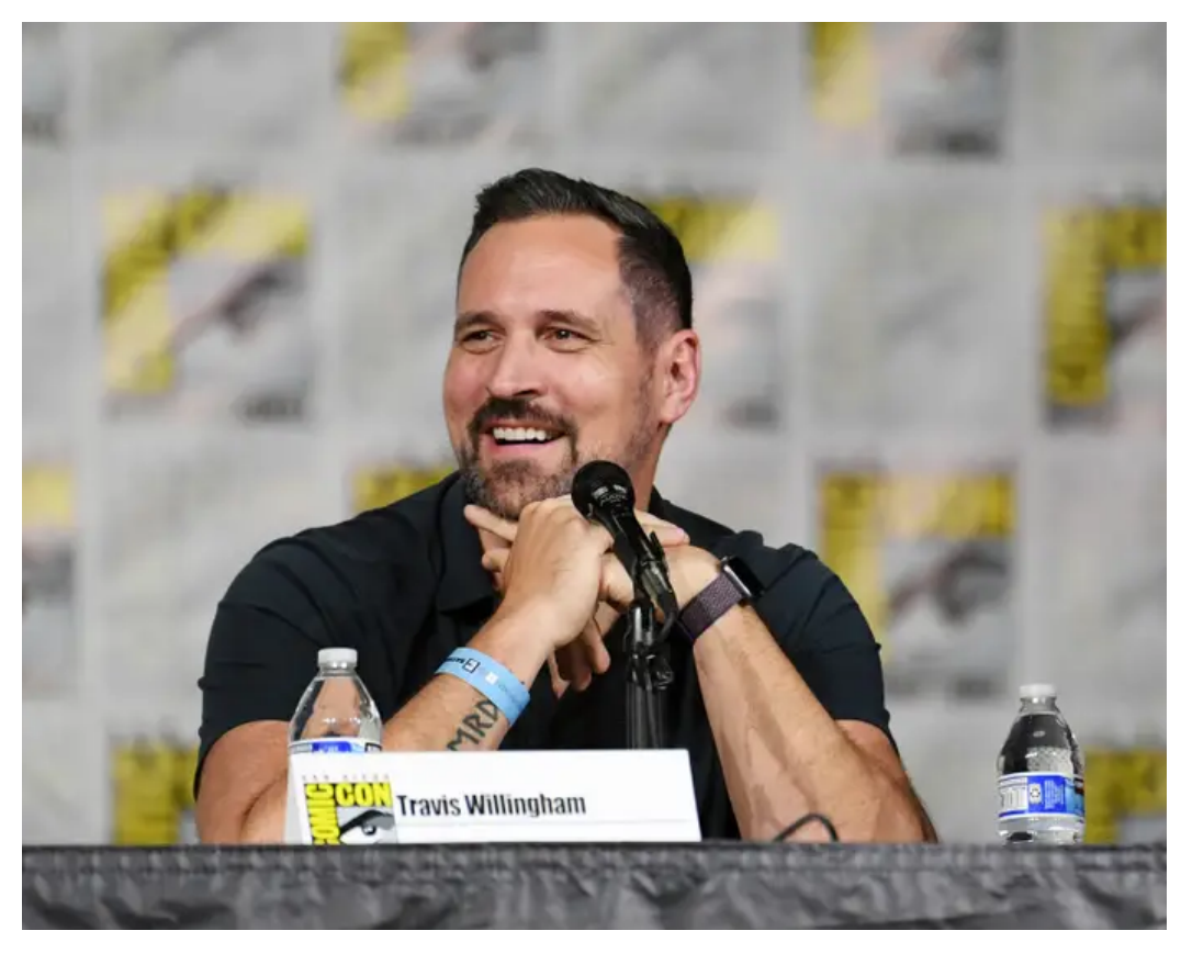
Willingham, at the San Diego Comic Con in July 2023.

Willingham recognizes Critical Role's expansion into animation and other aspects of gaming means they're competing in a crowded and increasingly saturated market.